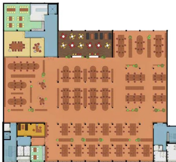
1st floor example of layout