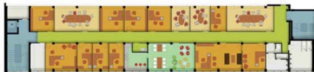
2nd and 3rd floors example of layout