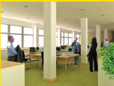
Office space example