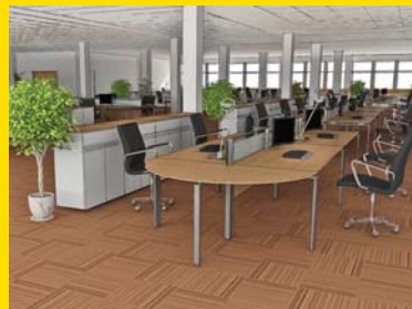
Office space example